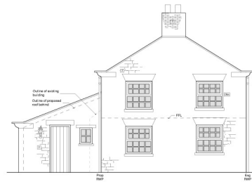
Proposed South Elevation