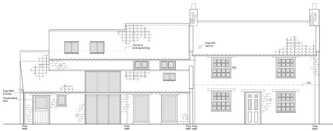
Proposed West Elevation